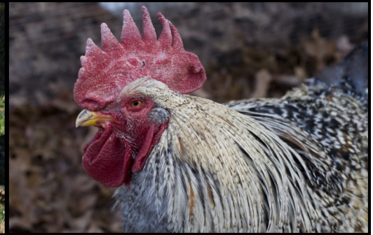
Bryarrios & the roosters