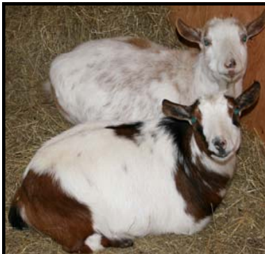
Topsy & Turvy, the Goats