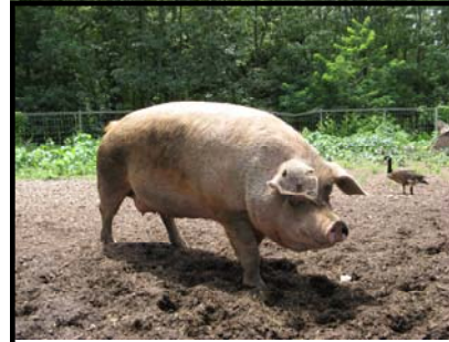
Charlotte, the Pig