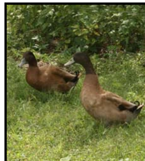
Our new ducks