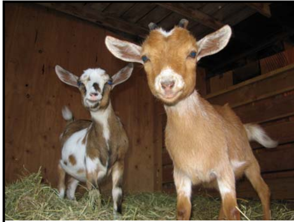
The Kids, Savannah and Cream Puff