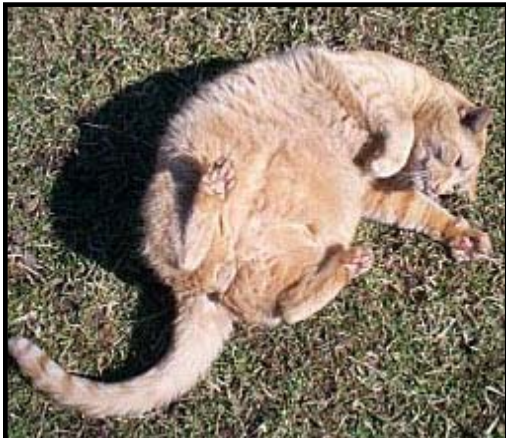
Steve, the Cat