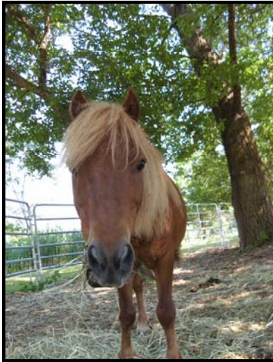
Shortie, the Pony