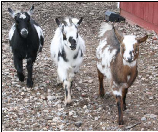
Pepe, Buddy, & Peanut, the goats