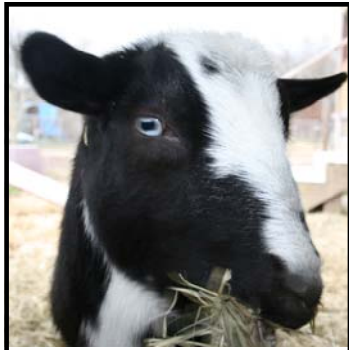
Cowie, the Goat