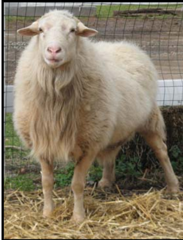
Jack, the Ram